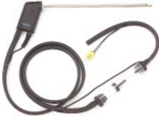
Probe P/N 24-7266 For Models 125 & 105

Each Fyrite Pro that is equipped with Draft / Differential Pressure includes gas pressure test tubing with barbed fitting for ease of appliance line and manifold gas pressure measurement.