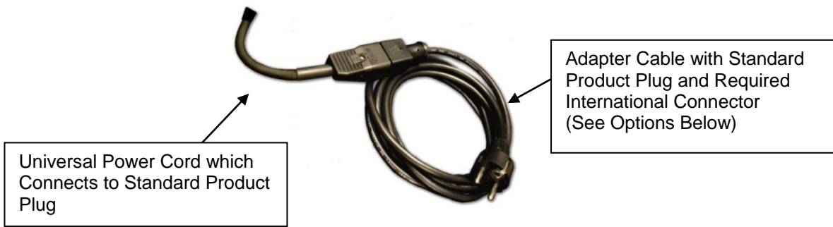
Typical Power Cord Options Available for the SA-2000-INTL Series